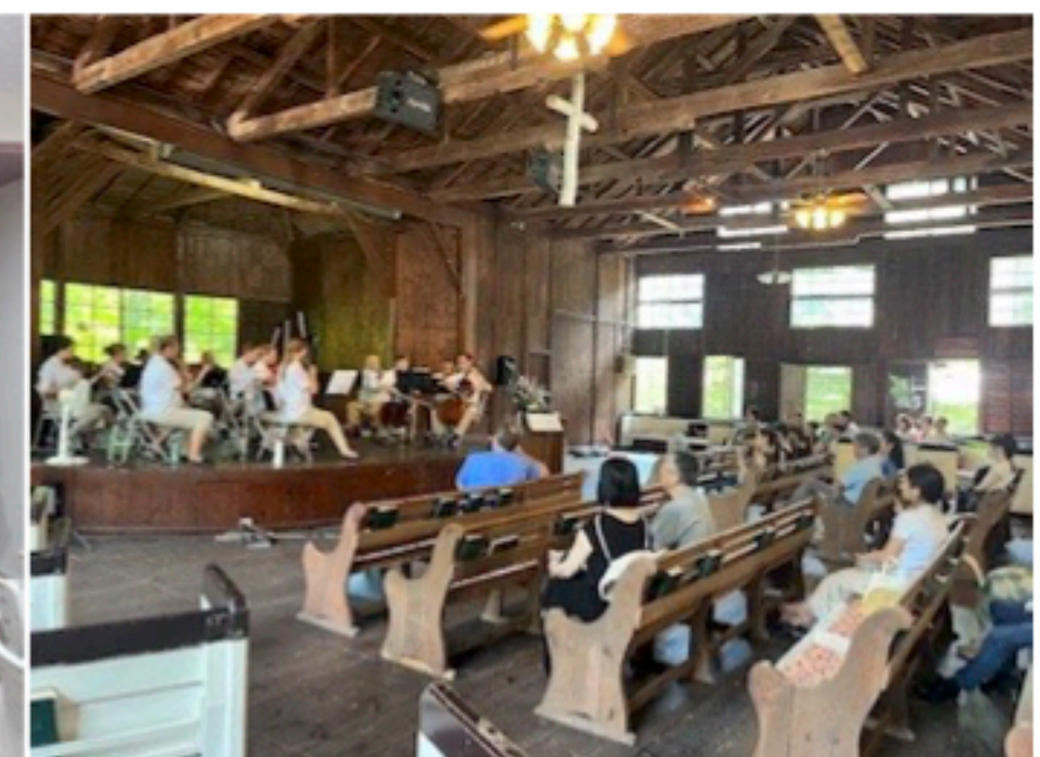
Suzuki Orch. Outreach in Karuizawa