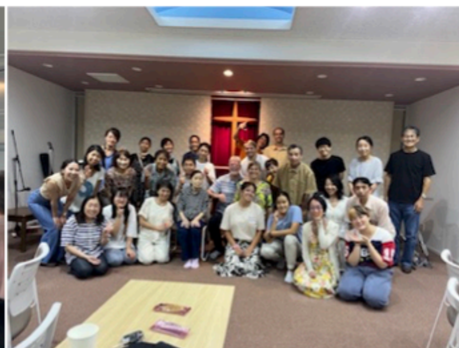
Aki & Team with Praise Power Gathering