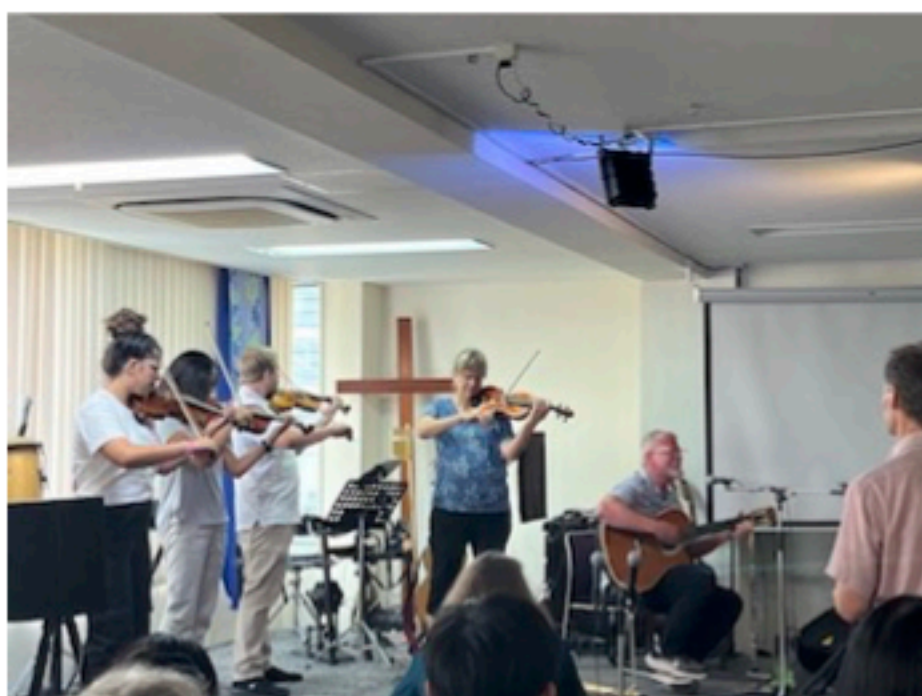
BUR Team at Osaka Int. Church