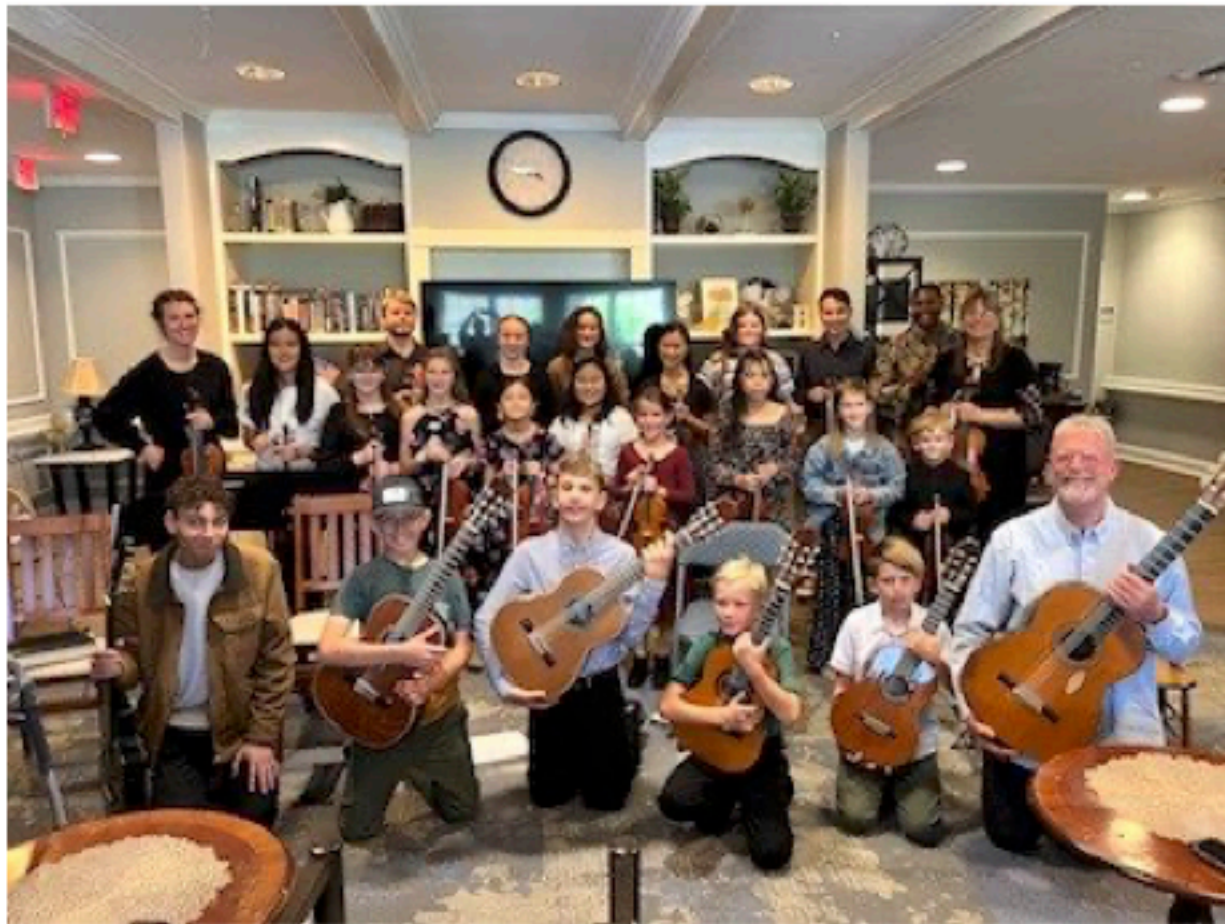
Violin & Guitar Student Recital at Assisted Living in KC