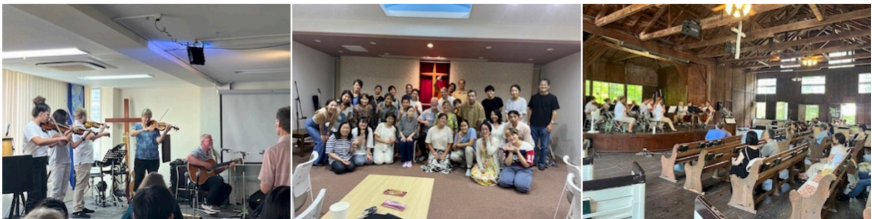
BUR Team at Osaka Int. Church